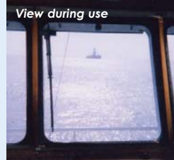
See the difference using a SOLASOLV™ screen can make!