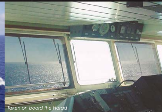
Taken on board the Harad

SOLASOLV roller screens are custom made and can be ordered direct from our factory or from our worldwide network of specialist Distributors.