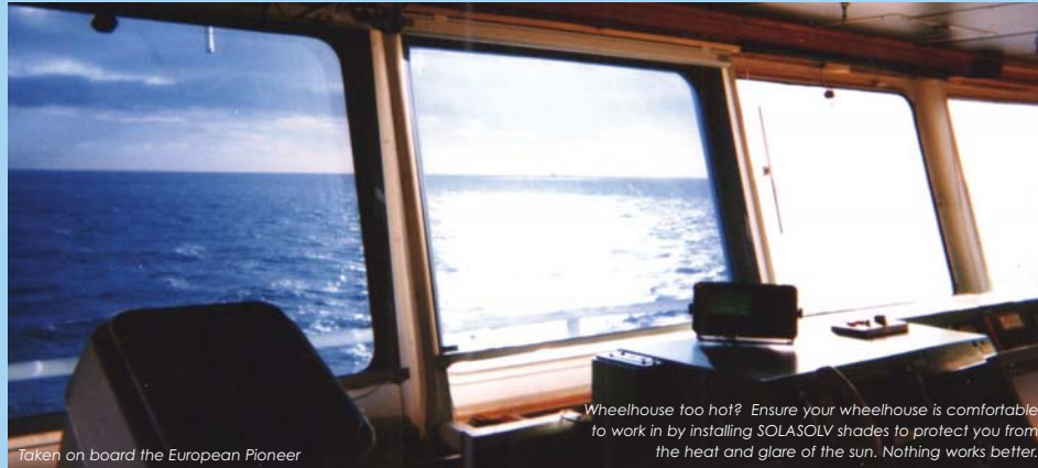
Taken on board the European Pioneer

Wheelhouse too hot? Ensure your wheelhouse is comfortable to work in by installing SOLASOLV shades to protect you from the heat and glare of the sun. Nothing works better.