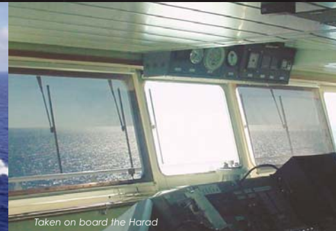
Taken on board the Harad

SOLASOLV roller shades are custom made and can be ordered direct from our factory or from our worldwide network of specialist Distributors.