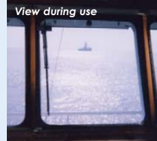
Sea the difference using a SOLASOLV™ shade can make!